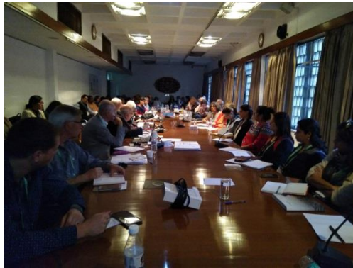
CIVVIH MEETING IN DELHI DECEMBER 9 2017