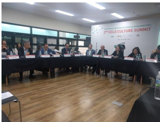
CIVVIH IN UCLG SUMMIT 2017