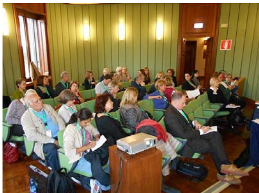
CIVVIH Official Annual Meeting in Florence 13 November 2014

18 th ICOMOS General Assembly and Scientific Florence 9-14 November 2014