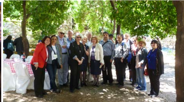
CIVVIH Mediterranean Sub-Committee meeting "Fortified Port Cities in the Mediterranean for the 21st Century. Sites, Values and Genius Lo", Alanya, Turkey 02-03 May 2014