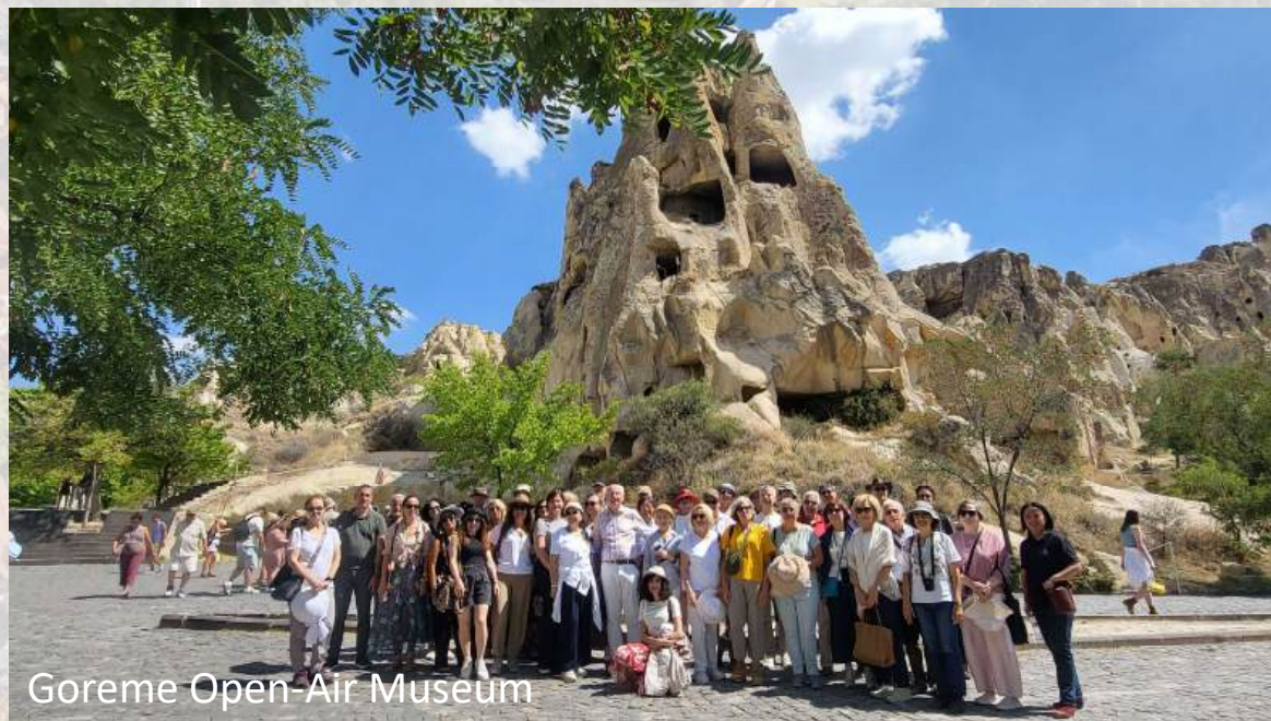
Goreme Open-Air Museum