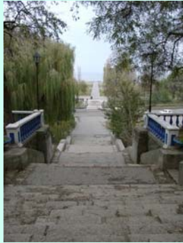
TAGANROG – THE STONE STAIRCASE TO SEA