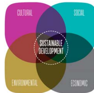
Figure 3: Holistic Four Domain Approach

Historic Preservation and Management of Cultural Landscapes in Germany