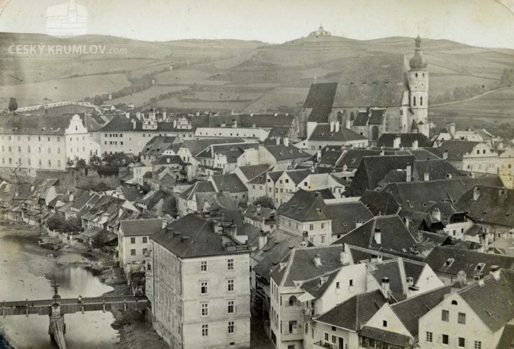
Český Krumlov, End of XIXth C, 1973, 1986