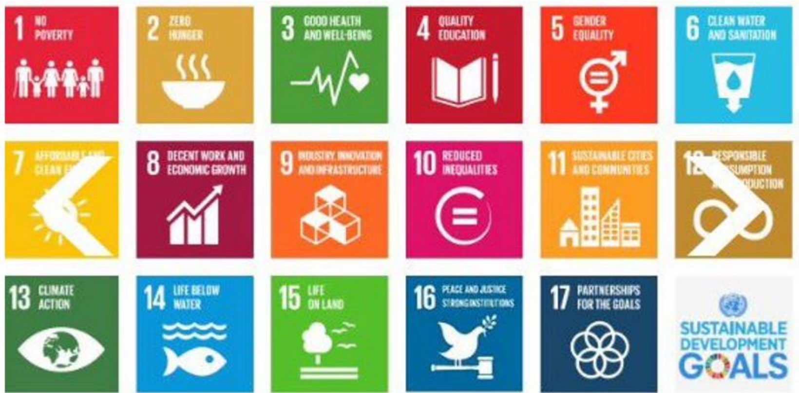
Figure 4: UN Sustainable Development Goals, 2015