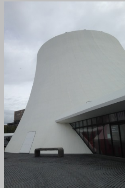
In and Out