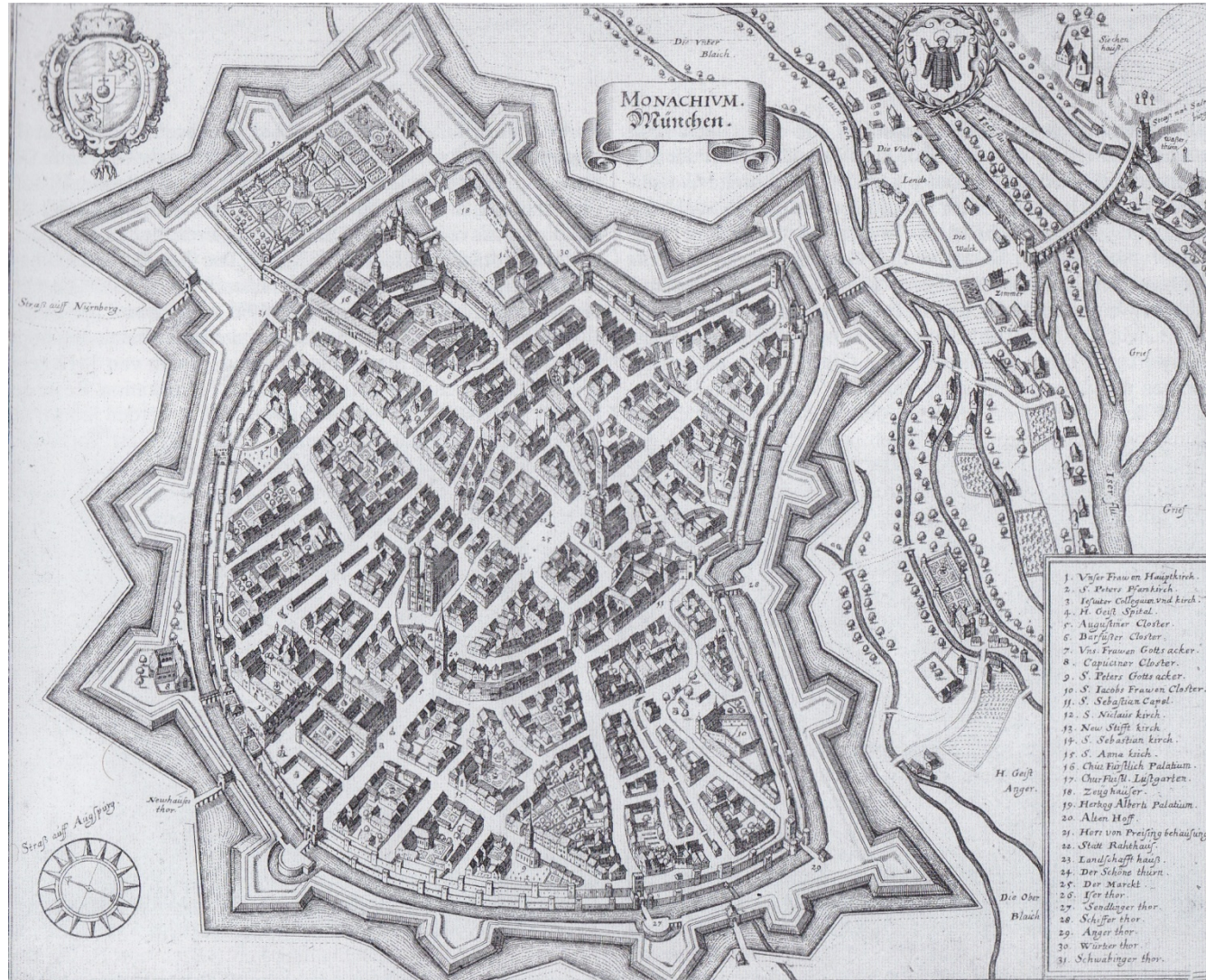
Figure 4: City Plan of Munich, Matthäus Merian, 1644