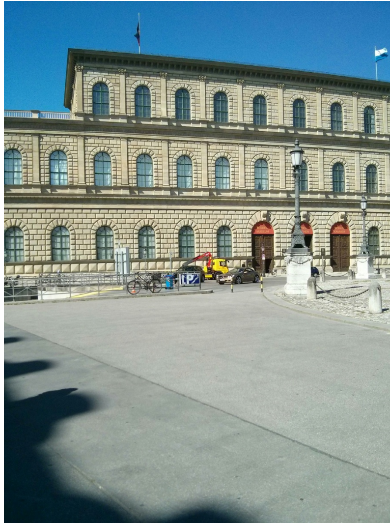
Figure 15: Munich, Max-Joseph Square – Max-Joseph-Platz