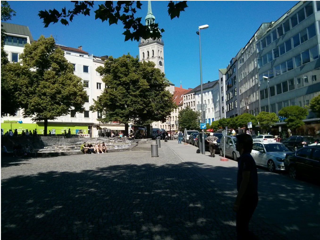
Figure 13: Munich, Cattle Market - Rindermarkt