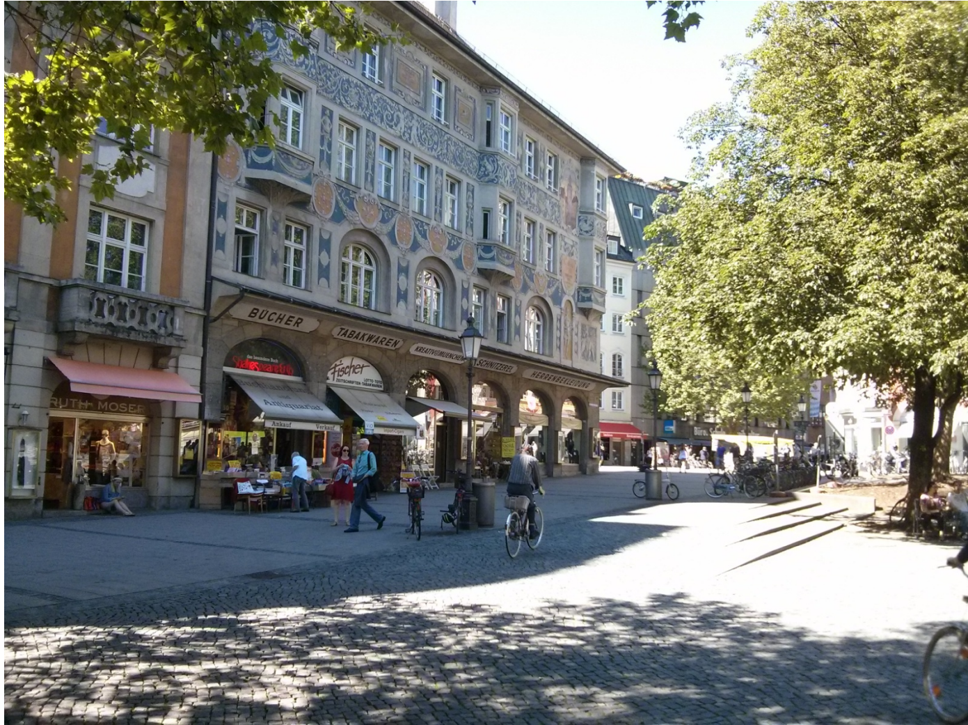
Figure 14: Munich, Cattle Market - Rindermarkt