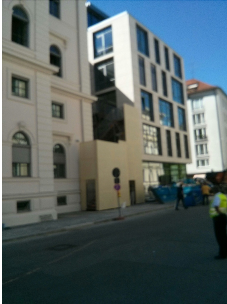
Figure 19: Munich, Wittelsbacher Square – Wittelsbacherplatz