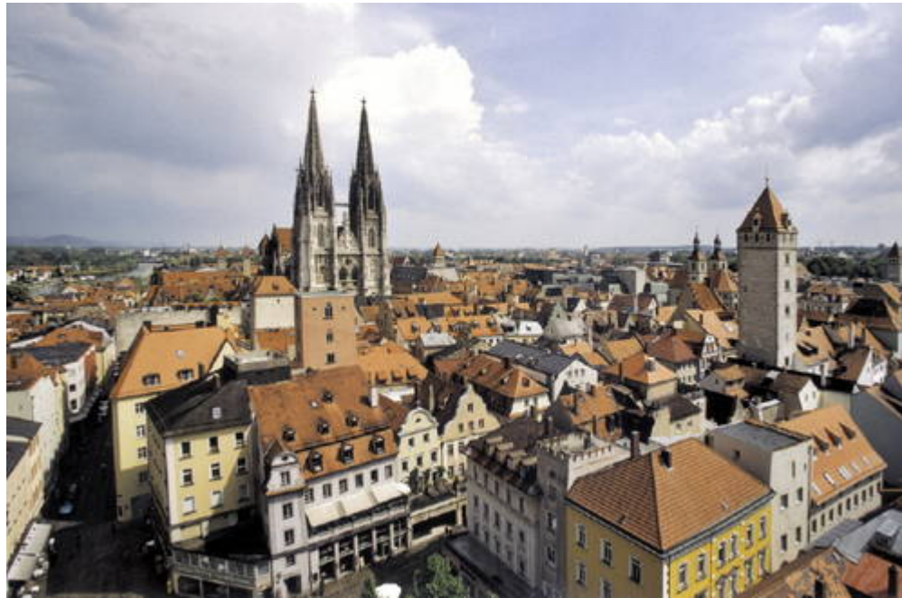
Figure 21: Old town of Regensburg