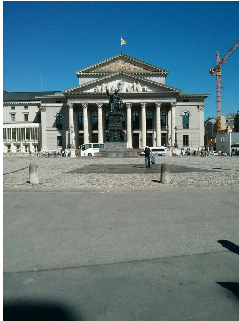
Figure 16: Munich, Max-Joseph Square – Max-Joseph-Platz