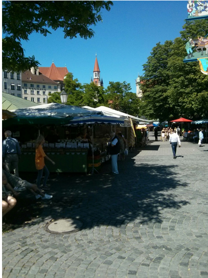
Figure 9: Munich, Food Market - Viktualienmarkt