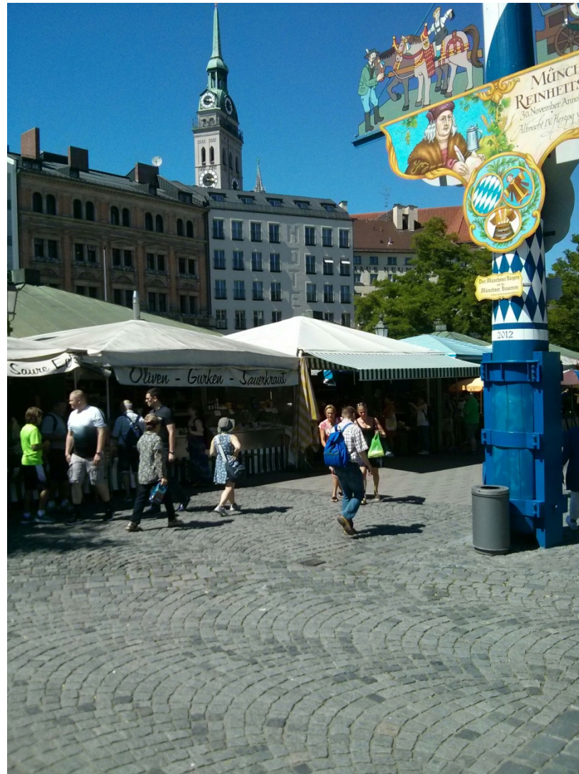
Figure 8: Munich, Food Market - Viktualienmarkt