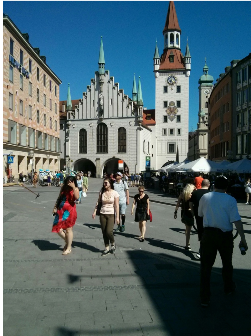
Figure 7: Munich, Marian Square - Marienplatz