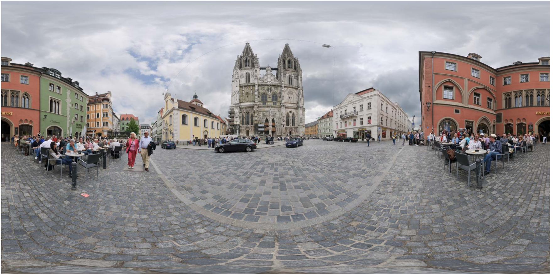
Figure 23: Regensburg, Cathedral Square - Domplatz