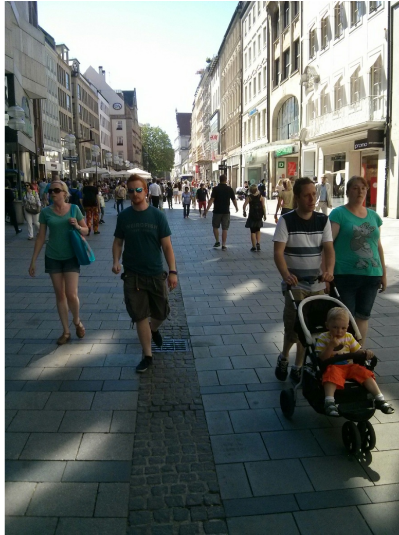
Figure 20: Munich, Pedestrian Zone: Kaufingerstraße/Neuhauser Straße