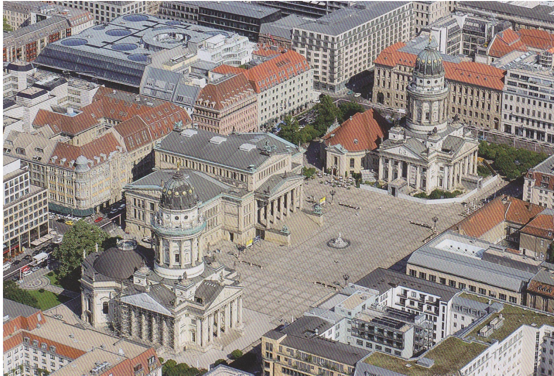
Figure 1: Berlin, Gendarmenmarket - Gendarmenmarkt