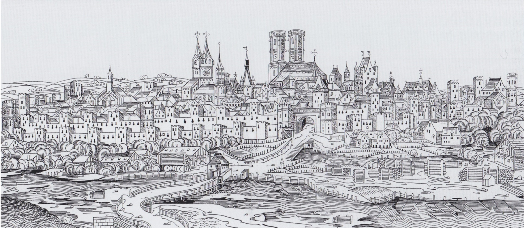
Figure 2: Depiction of Munich, Michael Wolgemut, 1493