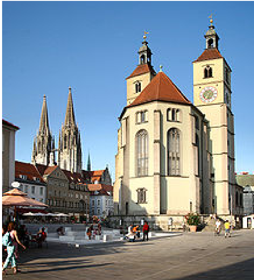
Figure 25: Regensburg, New Parish Square - Neupfarrplatz