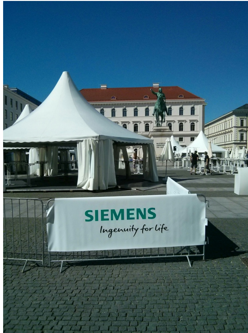
Figure 18: Munich, Wittelsbacher Square – Wittelsbacherplatz