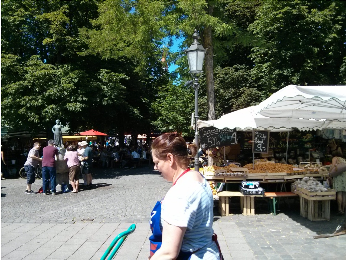
Figure 10: Munich, Food Market - Viktualienmarkt