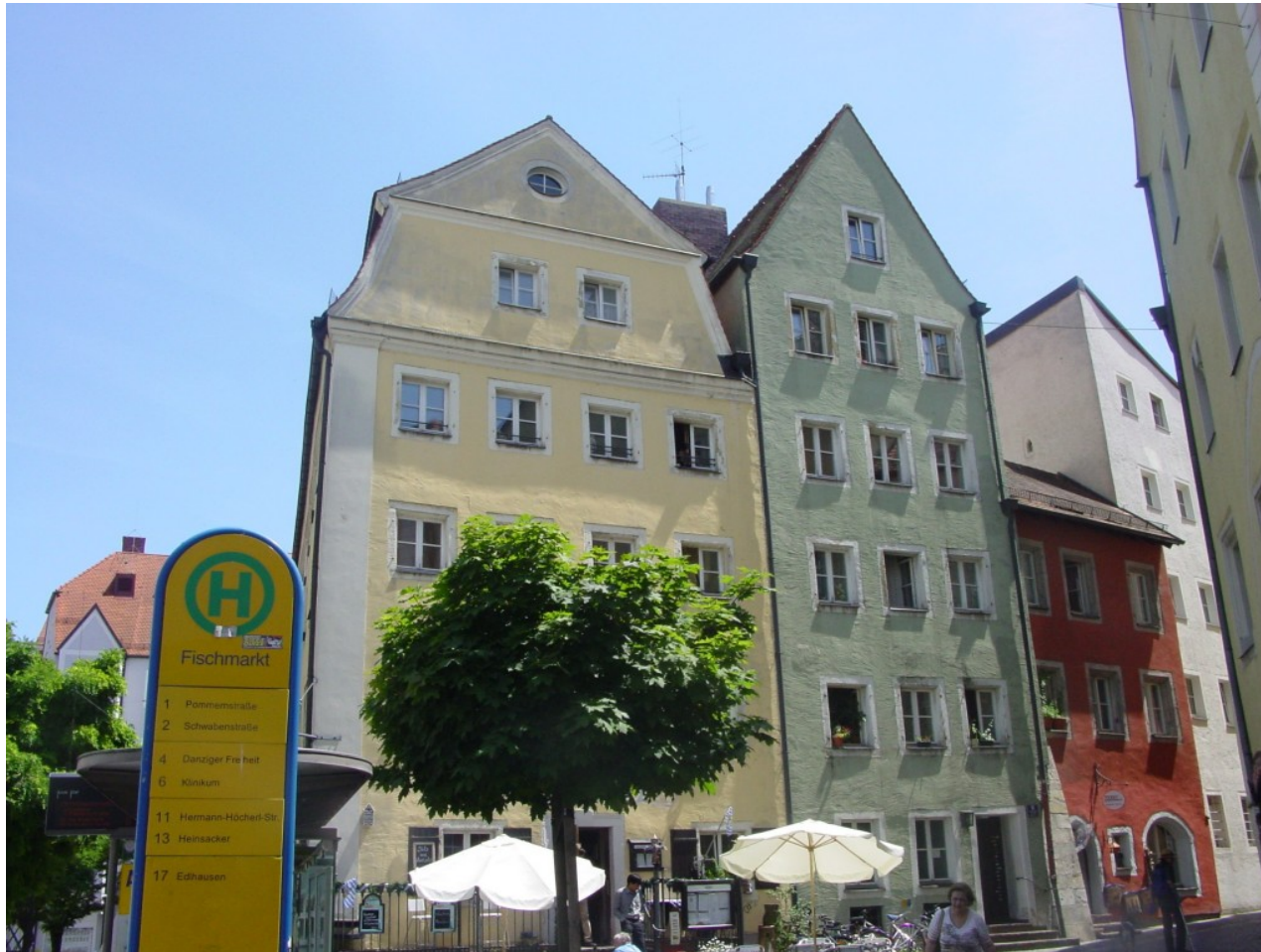
Figure 24: Regensburg, Fish Market - Fischmarkt