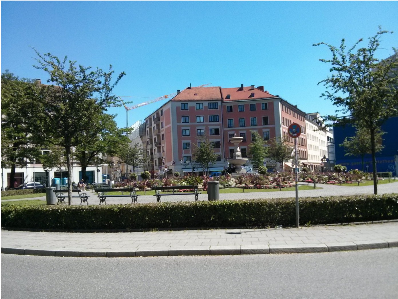
Figure 11: Munich, Gaertner Square - Gärtnerplatz