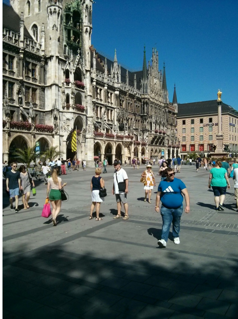
Figure 6: Munich, Marian Square - Marienplatz