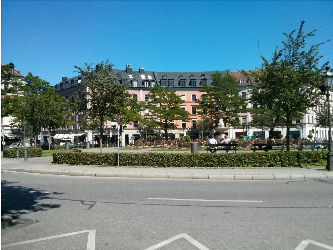
Figure 12: Munich, Gaertner Square - Gärtnerplatz