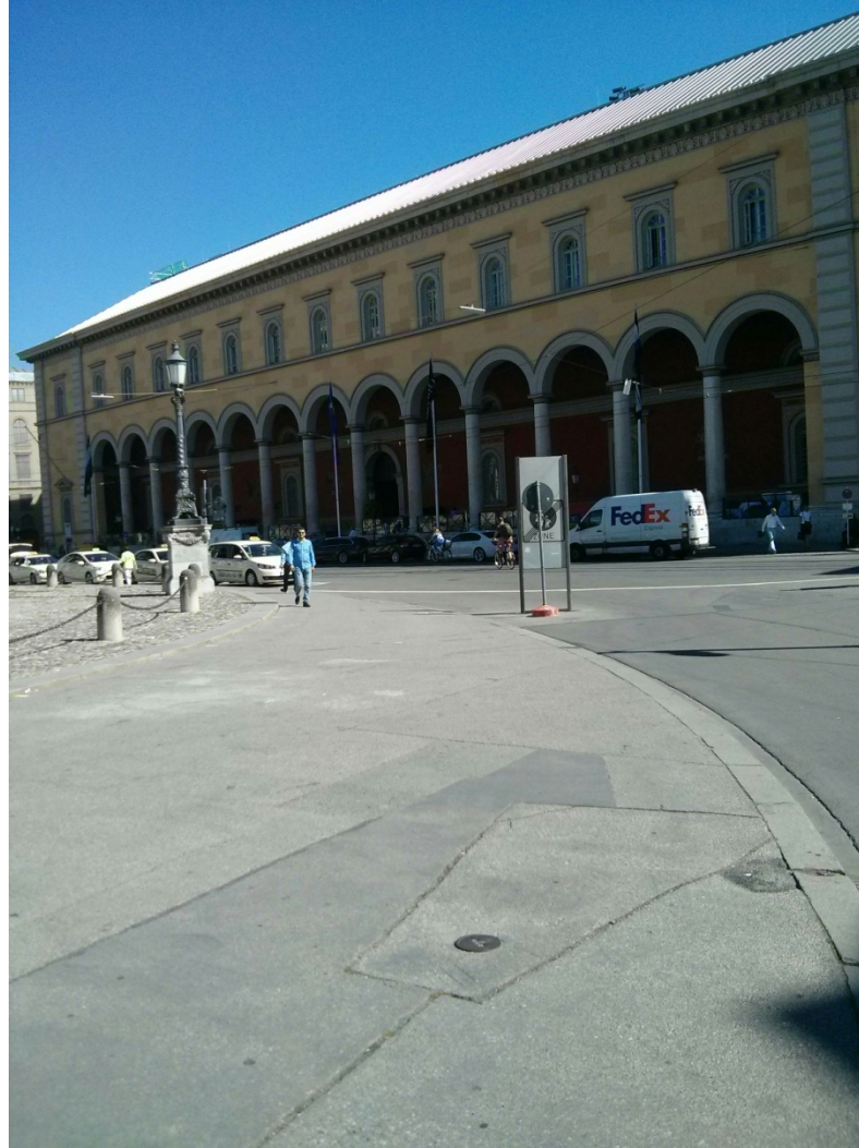
Figure 17: Munich, Max-Joseph Square – Max-Joseph-Platz