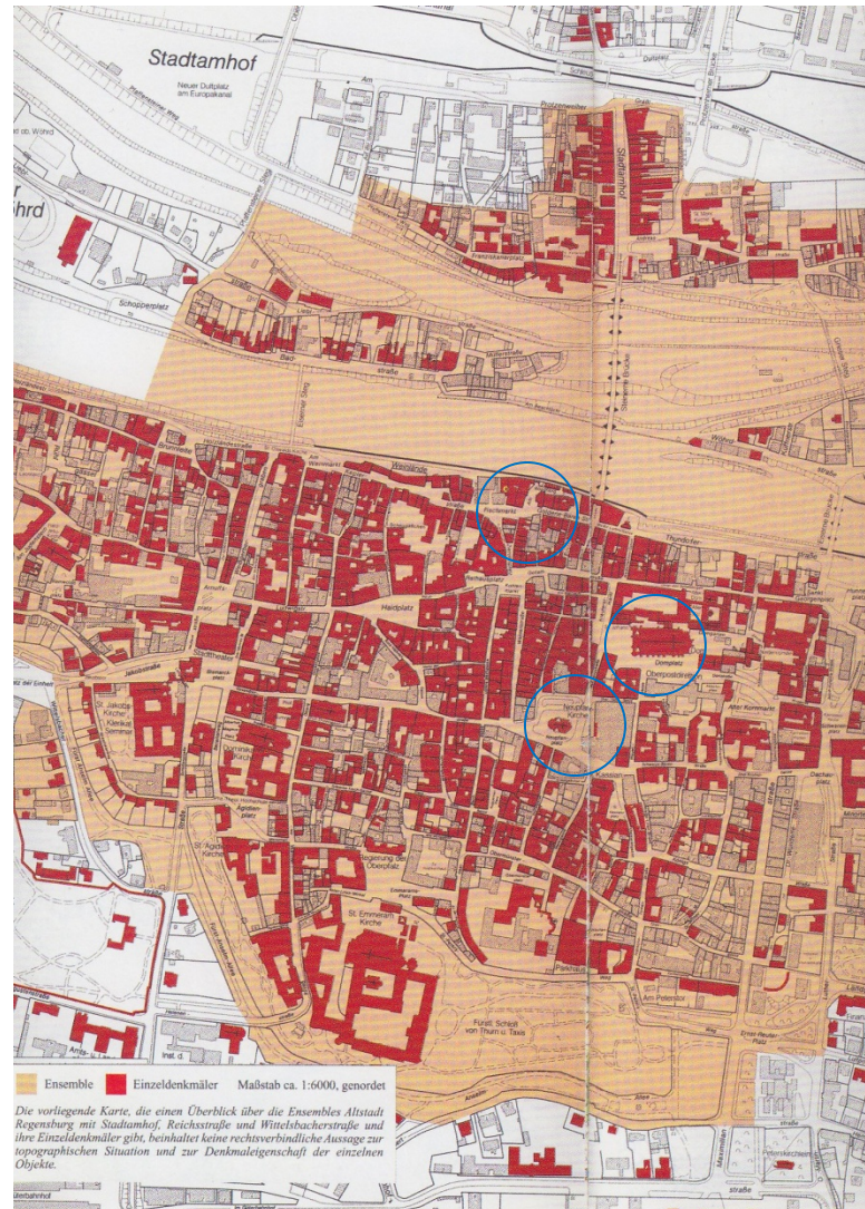
Figure 22: Regensburg, Map Ensemble Old Town