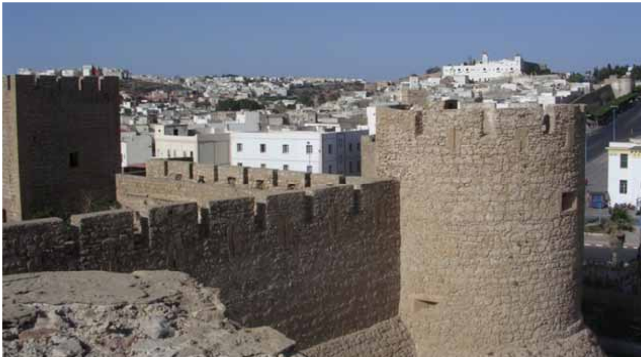
THE SEA' CASTLE, THE CITY' WALLS AND THE KESHLA