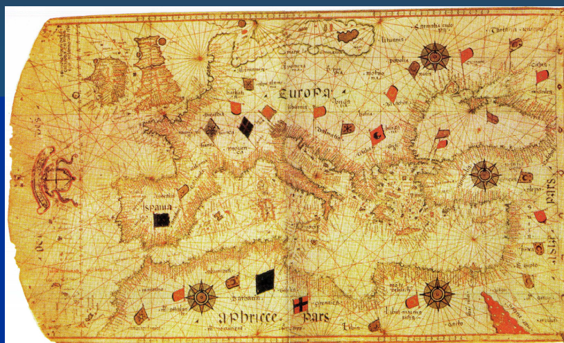
Μεσόγειος, 1561. Πλοιοπόνητος ασανόβλου.